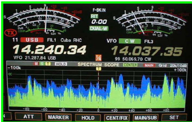
The top photo shows a snap shot of the IC-7800 spectrum scope while on 20 meters with the CHA250B. The frequency range displayed is 14.140 to 14.340 MHz. Notice the large number of strong signals across the band.

The following day would bring many more contacts on 10, 15, & 20 meters. Approximately 90 countries were worked over the weekend with minimal operating time. 10 meter contacts included: R1ANF, 9Y4W, KH7X, HP3BS, PJ4G & ZF2NT. 15 meter contacts included: OH0R, SK0X, ES5RW, S9SS, OH3RR, S58A, R1ANF & 8R1EA. 20 meter contacts included: TF3CW, EA8ZS, SO2R, OH6KN, UW2I, J68RI, RU1A, CN2R & EI7M. Over the next week, I made abundant contacts on bands from 10 thru 30 meters using several modes, including SSB, CW, RTTY & PSK. Some of which included: BG1JJR, ZD8AD, 9M6BG, YB7M, EA9EU, T77CD, HG3X & 9Z4FE. What was surprising is how well it played on 30 meters. Some of the stations logged on 30 meters were: JW0HS, TO7C, XT2JZ, V31TR, FS/KT8X, VP2V/DL7DF, FG/F5CWU, CE/W3WKP/M and even managed to work FT5XO on Kerguelen Island!